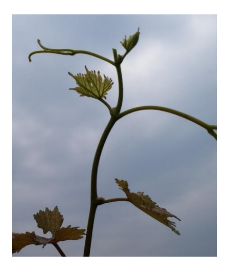
Fig. Only tip is removed

and training of shoots on the cordon will help to advance the cane maturity. Avoid hard pinching of green shoots since; this will encourage the emergence of more side shoots. Removal of 2-3 basal leaf will help to reduce the microclimate. During this period, only open canopy can help to advance the cane maturity and reduction in microclimate thereby reducing the chances of fungal diseases.