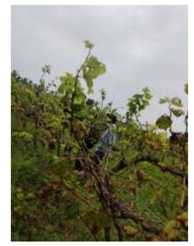
Fig. 2: Leaf fall due to disease incidence