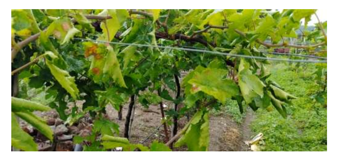
Fig. 4: Nutrient deficiency in vineyard

To avoid these, under the condition of rainfall, spray the nutrients as per the recommended dose. Loosening of soil around the root zone will create aeration thereby formation of white root required for uptake of nutrients.