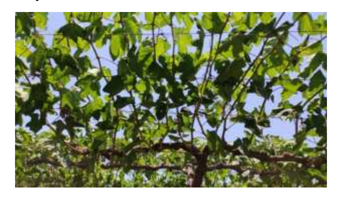
Fig. 1: Open canopy will help in controlling the diseases