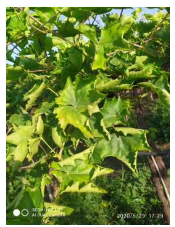
Fig. 3: Nutrient deficiency

With the excess rains, majority of the grape suffered with nutrient deficiency. In the vineyard where earthing up was followed, the leaching of nutrients including harmful elements was experienced. Root blackening was mainly due to the non-functioning of roots due to severe water logging also be responsible for hampering the uptake of nutrients resulting into leaf cupping, leaf yellowing, etc.