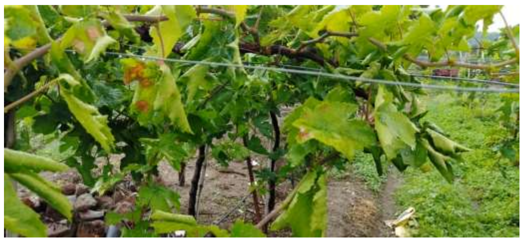
Fig. 4: Nutrient deficiency in vineyard

To avoid these, under the condition of rainfall, spray the nutrients as per the recommended dose. Loosening of soil around the root zone will create aeration thereby formation of white root required for uptake of nutrients.