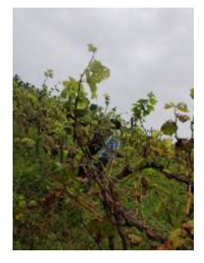
Fig. 2: Leaf fall due to disease incidence

Fig. 1: Open canopy will help in controlling the diseases