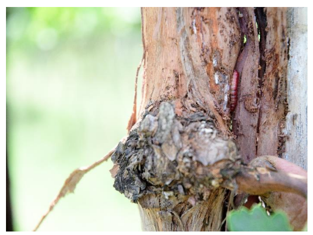
Fruit pruning growth stage: Dormant bud to sprouting