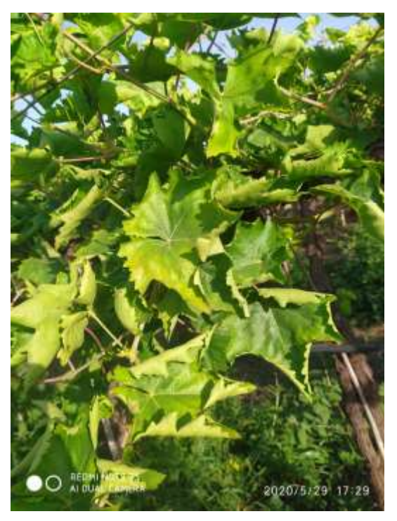
Fig. 3: Nutrient deficiency

With the excess rains, majority of the grape suffered with nutrient deficiency. In the vineyard where earthing up was followed, the leaching of nutrients including harmful elements was experienced. Root blackening was mainly due to the non-functioning of roots due to severe water logging also be responsible for hampering the uptake of nutrients resulting into leaf cupping, leaf yellowing, etc.