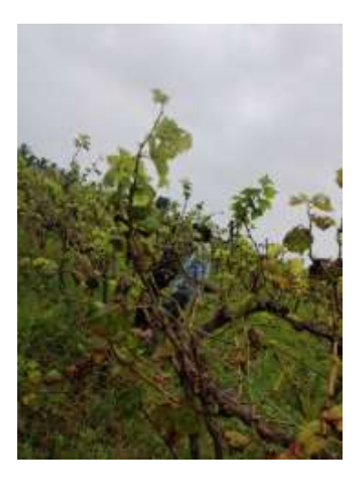
Fig. 2: Leaf fall due to disease incidence