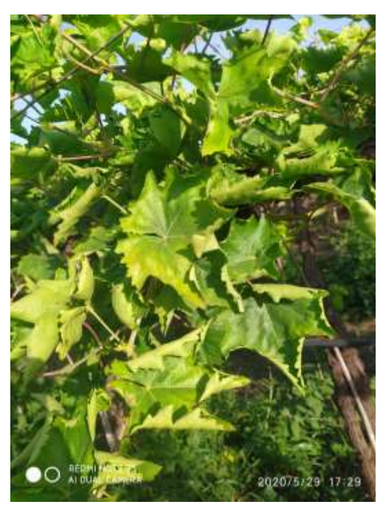
Fig. 3: Nutrient deficiency

With the excess rains, majority of the grape suffered with nutrient deficiency. In the vineyard where earthing up was followed, the leaching of nutrients including harmful elements was experienced. Root blackening was mainly due to the non-functioning of roots due to severe water logging also be responsible for hampering the uptake of nutrients resulting into leaf cupping, leaf yellowing, etc.