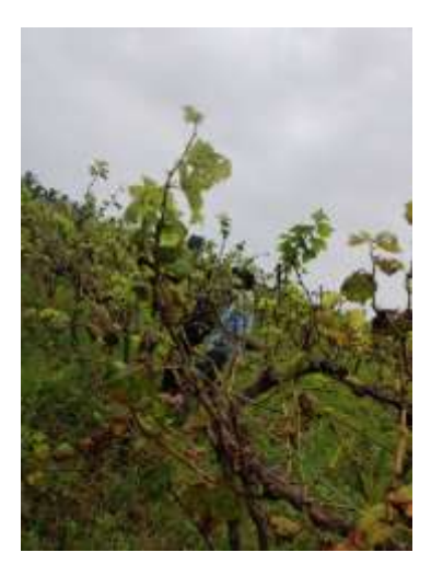
Fig. 2: Leaf fall due to disease incidence