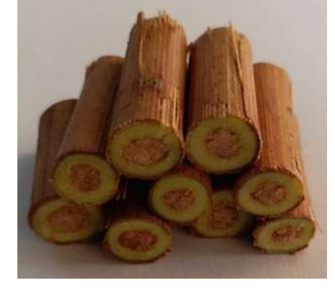
Rootstock shoots Matured Scion