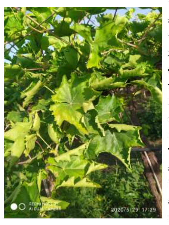
Fig. 3: Nutrient deficiency

With the excess rains, majority of the grape suffered with nutrient deficiency. In the vineyard where earthing up was followed, the leaching of nutrients including harmful elements was experienced. Root blackening was mainly due to the non-functioning of roots due to severe water logging also be responsible for hampering the uptake of nutrients resulting into leaf cupping, leaf yellowing, etc.