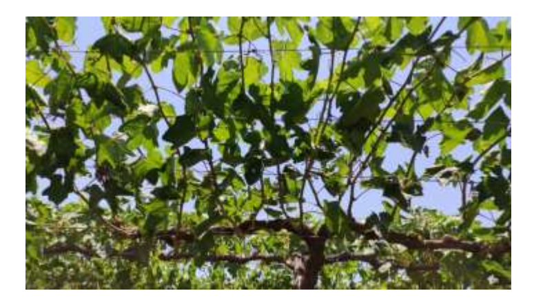
Fig. 1: open canopy will help in controlling the diseases

f) Spray 0:0:50 @ 4 to 5 g/L water will help to initiate the cane maturity or advancing the maturity.