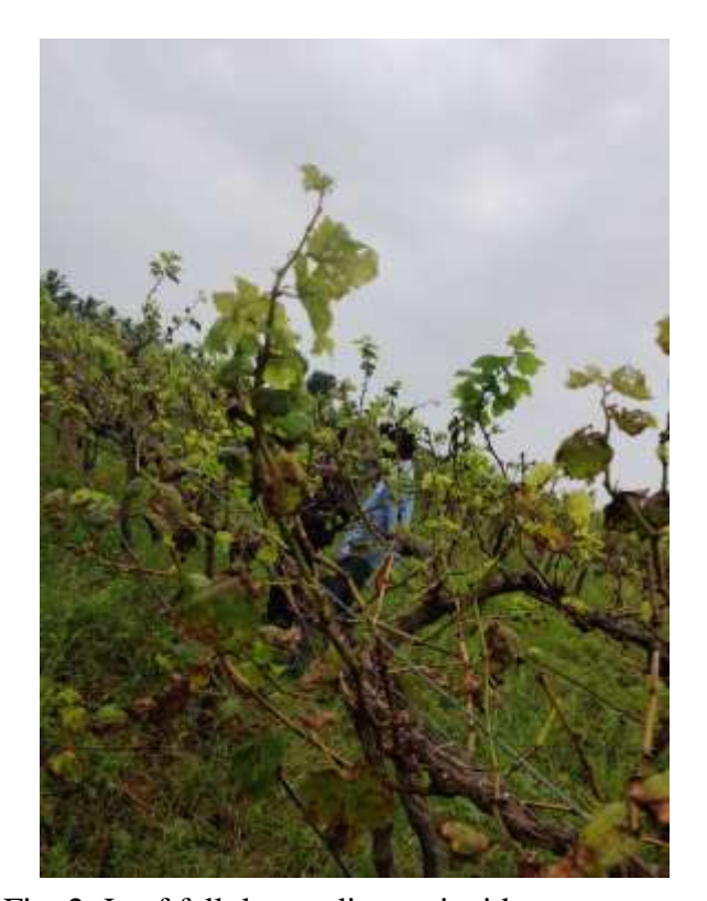
Fig. 2: Leaf fall due to disease incidence