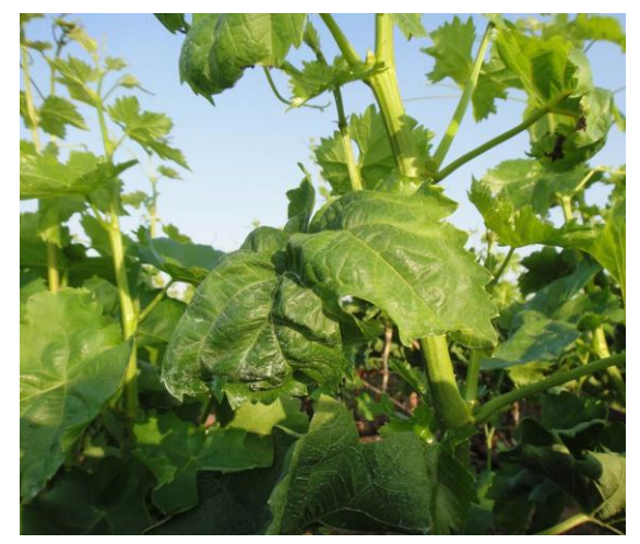
Fig. 8. Leafhopper damage

which results in leaf curling (Figure 8).