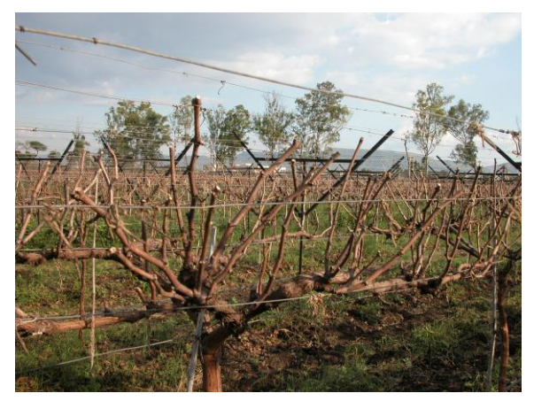
Fig. 10. Fruit Pruning of vine

5. While removing the excess shoots from the cordon, remove both vigorous and weaker shoots so that all the shoots will be uniform in diameter. This will promote