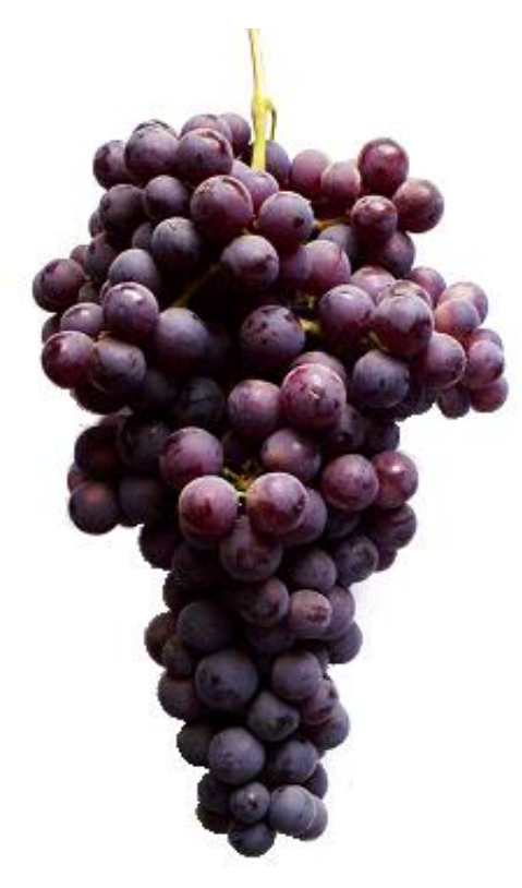
Fig. 5. Flame Seedless

It was obtained as a result of complex 3 generation hybridization made at USDA, Fresno, California, USA.