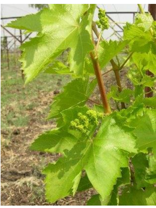
f. N deficiency