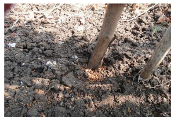
Fig. 17. Stem borer frass around plant

infest single vine and parts like trunk, cordons and also branches having more than 1.5-2 cm diameter are preferred. Bored holes, heaps of excreta (either in pellet or in powder form) in and around the vines (Figure 17), general weakness of the vine, chlorotic leaves etc. are the symptoms