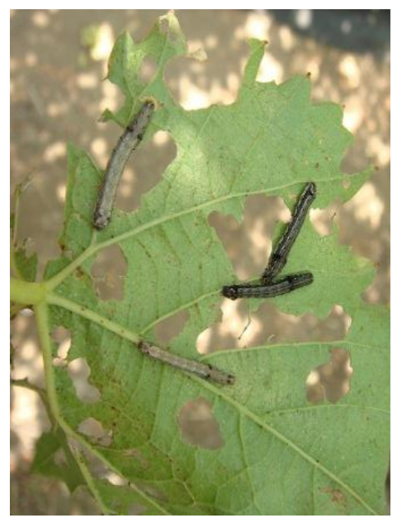
Fig. 13. Spodoptera litura larva

though occasionally they emerge as a serious pest. During the flowering and fruiting stage if relative humidity increases due to rainfall, Spodoptera litura (Figure 13) may become a