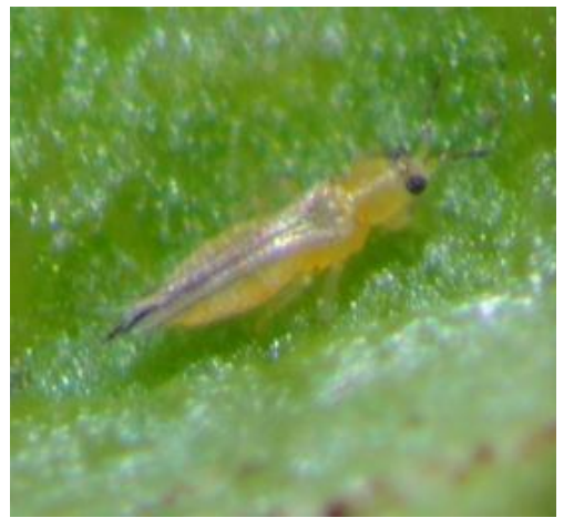
Fig. 1. Scirtothrips dorsalis

Thrips are the sucking pests which prefer to feed on the succulent and juicy tender parts of the vine, like young growing shoots and appear after both the prunings. This insect enjoys the warm, bright sunlight combined with slightly higher temperature and low relative humidity. It disperses very easily in the vineyard as they are very active