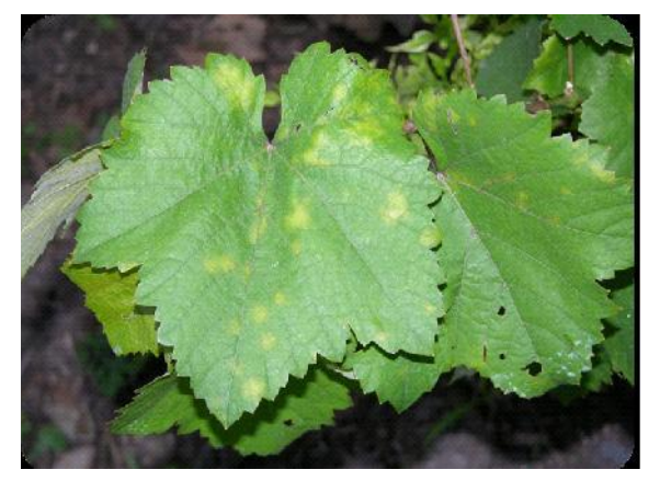
Fig. 1. Grape leaves showing oily spot symptoms of downy mildew

From April to first week of June usually the climate is hot with temperature ranging from 35-40°C and dry with relative humidity > 40%, hence there is least possibility of development of any disease. However diseases occur during monsoon period when rains are received any time from second week of June till middle of October. In most grape growing areas 300 to 500 mm rain is received annually and there are about 30-45 days recording more than 4 mm rain per day from June to October.