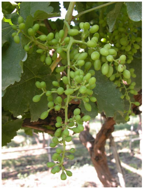
Fig. 14. Well filled bunch after berry thinning

one shoot if the diameter is less than 8 mm.