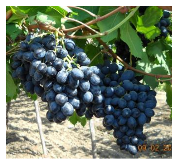
Fig. 8. Autumn Royal

The variety has bold berries, purple black to black in colour, ovoid to ellipsoidal in shape. The berry flesh is firm and translucent, skin medium thick. It is a late maturing variety. This variety does not require GA_3 for thinning/ sizing. Some clusters may require a manual thinning. Without