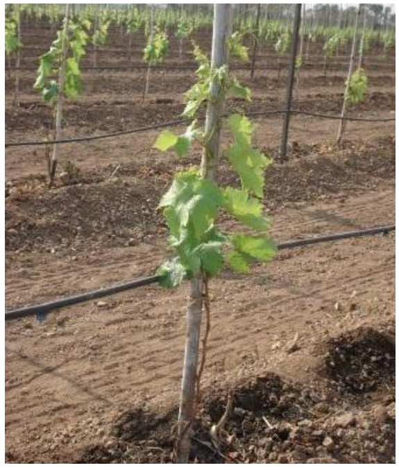
Fig. 3. Training after grafting

Training system used in vineyard should fulfil the following requirements.