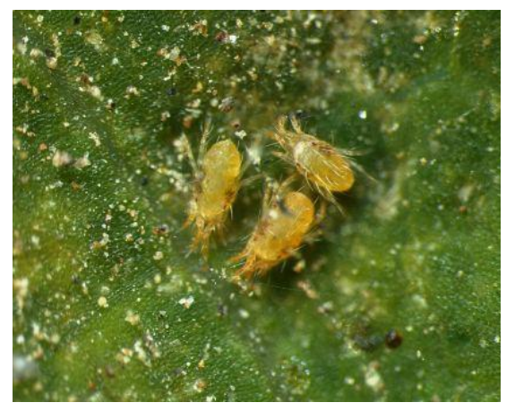
Fig. 14. Tetranychus urticae

Tetranychus urticae (Figure 14) is the major species causing damage to grapes in India. Mites are important group of non-insect pest attacking grapevine. They are also sucking pests and prefer high temperature and low