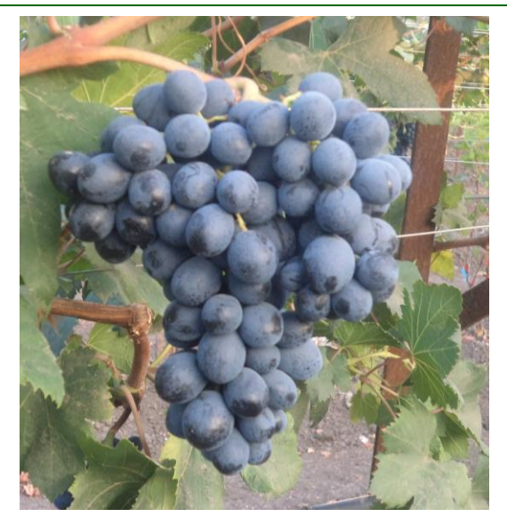
Fig. 1. Lost bloom from berries

Careful handling of grapes during harvesting, transporting, cleaning and packing is very essential to prevent injury and abrasion. The bunch should always be held by stem/ peduncle. Rough handling results in loss of bloom (thin wax coating on berry surface) making the berries susceptible to decay (Fig 1).