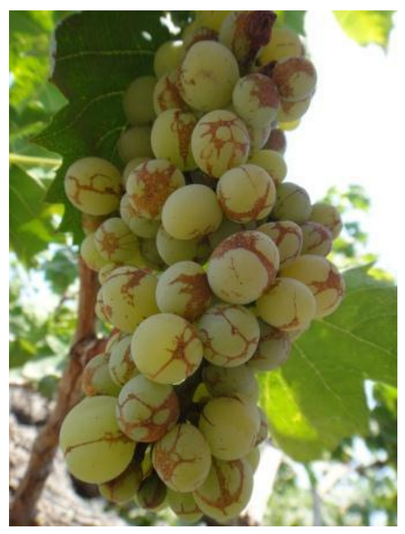
Fig. 6. Fruit scarring by thrips

like appearance on the berry surface as well as scab formation (Figure 6). Therefore, the new flush emergence stage, flowering and berry setting