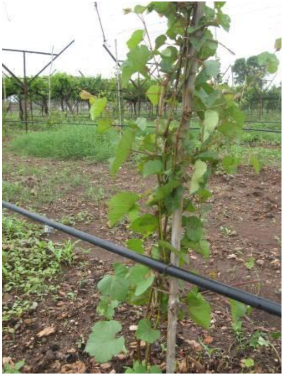
Fig. 2. Training of rootstock

availability of the skill workers the selection of training system is decided. The growth potential of grapevine and the condition under which the vine is grown are never uniform. The trellis used for training the vine is decided during the first year itself.