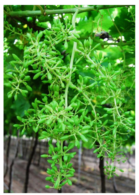
Fig. 4. Berry elongation

For quality grape, berry diameter is more important than the berry length or the overall size of the berries. GA_3 (@ 40 ppm) along with CPPU (forechlorofenuron) 0.1%L (@1-2 ppm) is used at 3-4 mm berry size and second dip of GA_3 @ 30 ppm + CPPU @ 1 or 2 ppm at 6-8 berry stage.