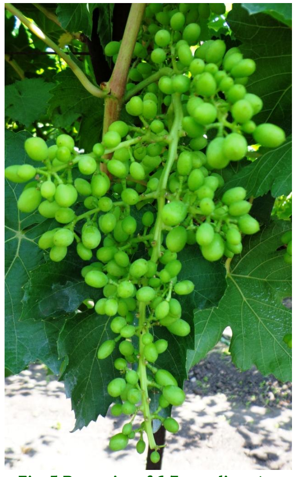
Fig. 5 Berry size of 6-7 mm diameter