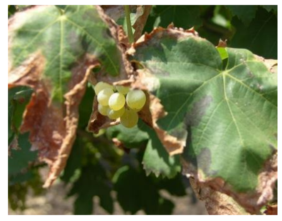
i. Leaf blackening and necrosis caused by potassium deficiency and sodium toxicity