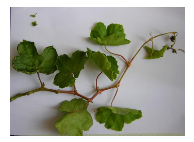
g. Boron deficiency