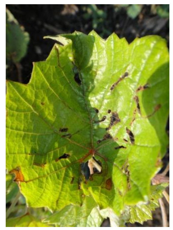
Fig. 12. Characteristic linear leaf damage by flea beetle

leaves are the characteristic damage symptoms by this pest (Figure 12).