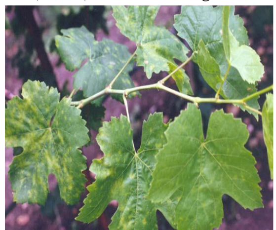
Fig. 3. Powdery mildew symptoms on leaves showing shiny chlorotic spots

Details of chemicals, their doses, PHI, MRLs are given in