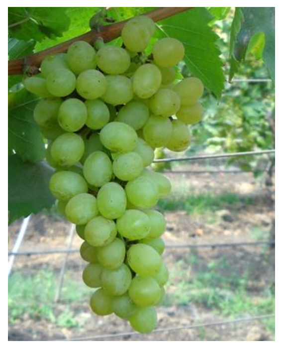
Fig. 1. Thompson Seedless

Worldwide, it is the major table grape variety. In India, it is being cultivated commercially for about last five decades. Thompson Seedless along with its clones have been successfully cultivated for table as well as for raisin making and presently occupy 70 per cent area approximately of the total 1.12 lakh hectares under grape cultivation in the country during 2011-12. Fruit vields of 20 tons of quality grapes per hectare can be obtained with this variety. Under peninsular Indian conditions the fruit is normally harvested after 120-150 days of forward pruning. The berries continue to ripen even in warm summer days and these cultivars are suited for staggered production. Some of the clonal selections from Thompson Tas-A-Ganesh Seedless like and