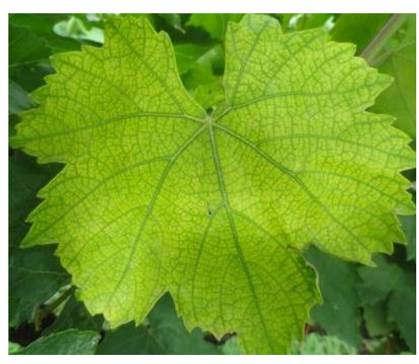
c. Fe deficiency