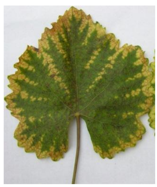
e. Mg deficiency