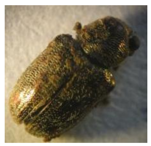
Fig.11. Flea beetle

leaves are the characteristic damage symptoms by this pest (Figure 12).