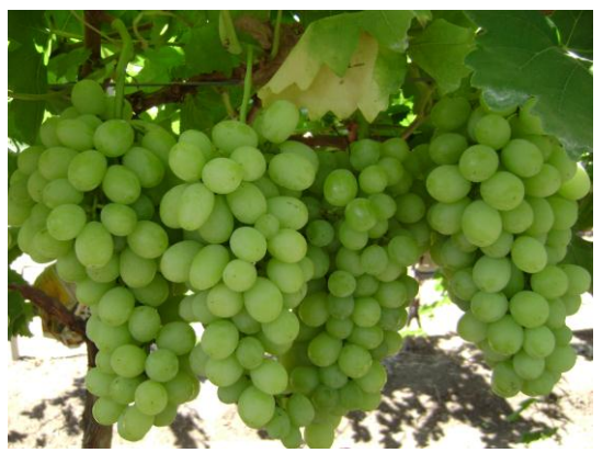
Fig. 15. The vine before harvest

bunches. This helps in increasing the berry size.