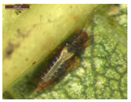
Fig. 3. Retithrips syriacus

Fig. 2. Rhipiphorothrips cruentatus insects. Mainly two thrips species, viz., Scirtothrips dorsalis (Figure 1) and Rhipiphorothrips cruentatus (Figure 2) cause damage to growing shoots, flowers and berries of table grapes in India. A third thrips species, Retithrips syriacus (Figure 3) is also reported in grapevine, however, it remains only on old leaves and does