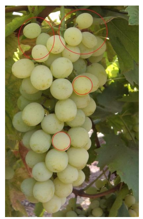
Fig. 4. Remove uneven sized berries

scissors to avoid injuries to the side berries. The berries should never be pulled out by hand as the portion of the pedicle along with pulp from the berry that remains attached to the bunch (wet brush) is a hot spot for the