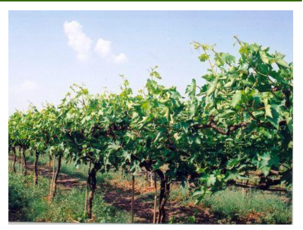
b. Excess nitrogen