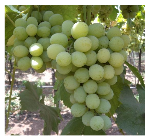
Fig. 6. Bloom intact with berries

6.1.1 Extra Class: Grapes must be of superior quality (Fig 7). The bunches must be typical of variety in shape and colour and have no defects (Fig 5). Berries must be firm, firmly attached to the stalk, evenly spaced along the stalk and have their bloom virtually intact (Fig 6).