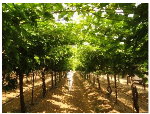
a. Excess nitrogen