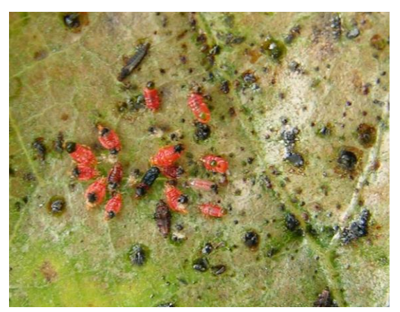
Fig. 4. Retithrips nymphs on leaf

not cause any economic damage either to berries, flowers or leaves. Nymphal stage of Retithrips is reddish in colour and farmers often confuse it with red spider mites, therefore, correct identification is important (Figure 4). Both nymphs and adults