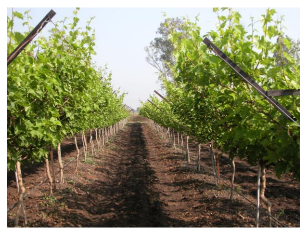
Fig. 7. Well trained vineyard

Canopy refers to the size and shape of vine structure. The size and