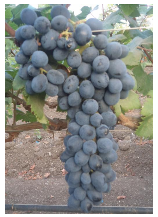
Fig. 8. Autumn Royal Class-I

The grapes should be transported to pre-cooling units within 4-6 hours of harvest. The temperature of harvested grapes should be brought down to less than 4°C within six to eight hours in the pre-cooling chambers. If the pre-