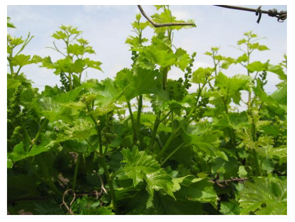
Fig. 13. Stage of excess bunch removal

8. Retain only one or two bearing shoots on each cane. If the cane diameter is more than 8 mm, retain two bearing shoots and only