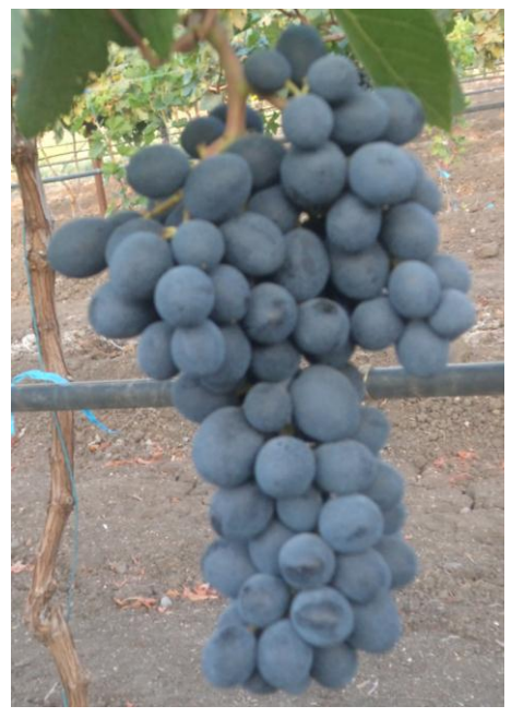
Fig. 7. Extra class Manjri Naveen and Autumn Royal