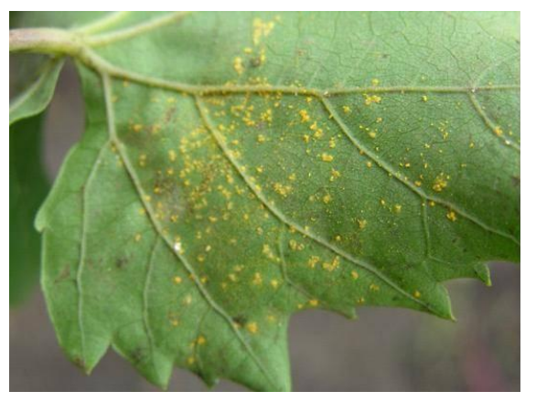
Fig. 6. Rust infection on leaf of Thompson seedless