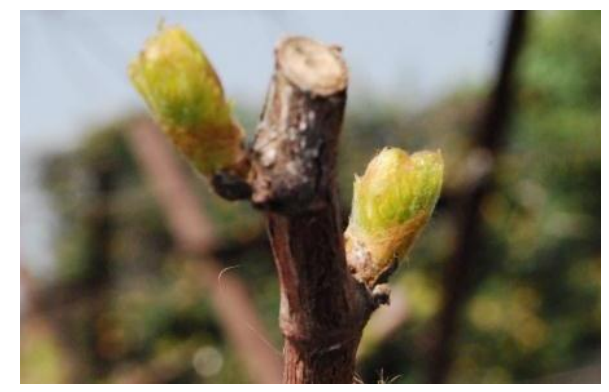
Fig. 1. Budbreak

After fruit pruning, hydrogen cyanamide 50 SL @ 30-40ml/L (based on cane thickness) is applied on apical 2-3 buds within 2 days of pruning to increase uniform budbreak.