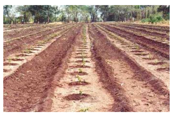
Fig 2. Rootstocks planted in pits opened on the trenches

transplanting shock and field mortality (Fig 2).