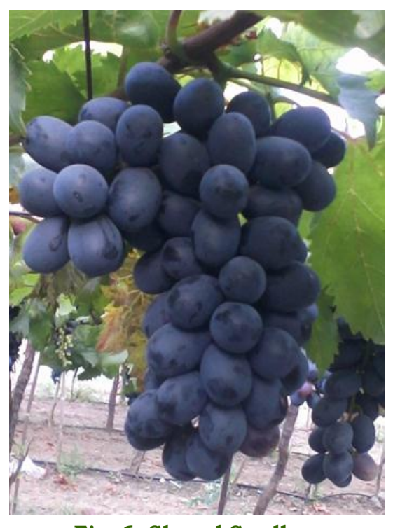
Fig. 6. Sharad Seedless selections are made by farmers, those respond well to hormone applications

It is a clonal selection from the Russian variety Kishmish Chernyi (Black Sultana). Recently, 4 clonal