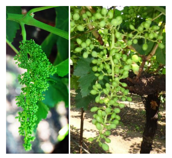
Fig. 3. 50% flowering and berry thinning

Treatment of GA<sub>3</sub> after berry set