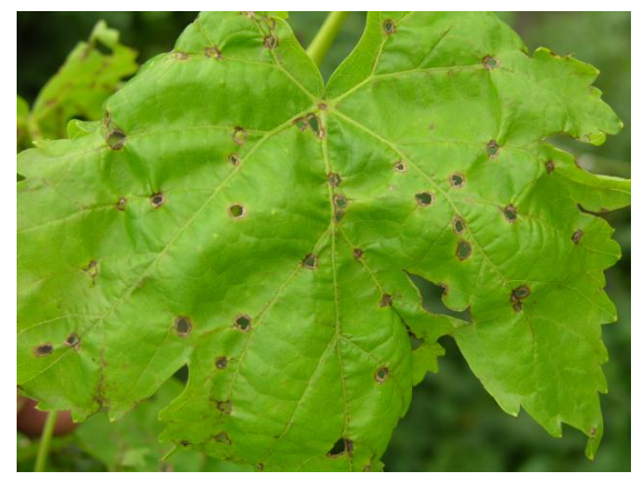
Fig. 5. Characteristics symptom of anthracnose on leaf showing shot hole

http://www.weather.nic.in/current.htm , http://www.imd.gov.in/section/nhac/wc h/todaywch.htm ,http://www.imd.gov.in/ section/nhac/distforecast/INDIA.htm http://www.accuweather.com/worldforecast.asp?partner=accuweather&travel er=0&locCode=ASI|IN|IN021|JUNNAR& metric=1 ,http://fallingrain.com