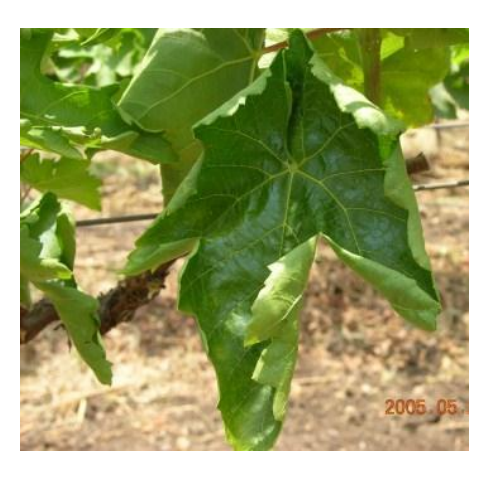
h. Inward leaf curling and shiny spots on leaves caused by potassium deficiency