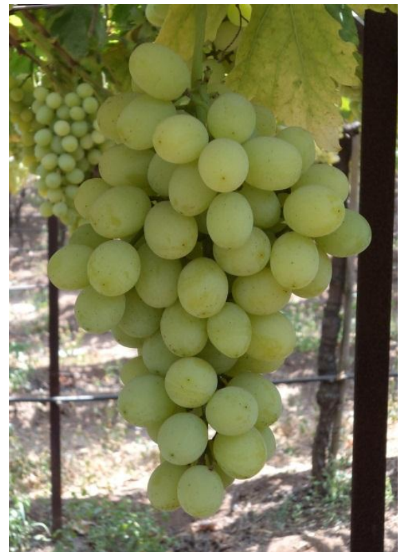
Fig. 5. Bunch without any defect having even coloured berries

The table grapes are graded into three classes defined below: