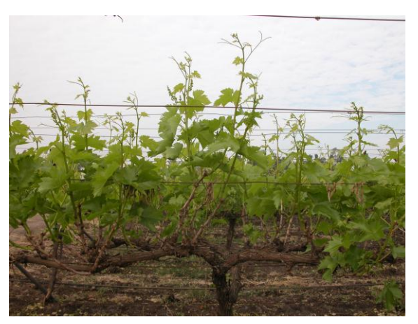
Fig. 12. Stage of excess shoot removal after fruit pruning