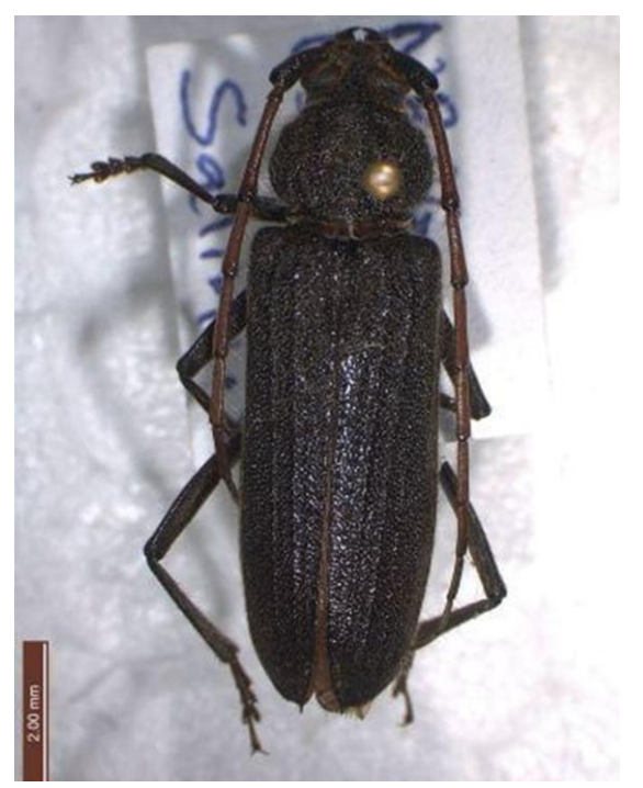
Fig. 15. Stromatium barbatum

Stem borer has recently attained the status of major pest of grapevine in India. Stromatium barbatum (Figure 15) and Celosterna