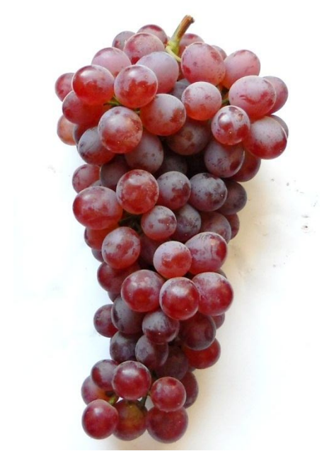
Fig. 10. Blush Seedless

Vines are moderately vigorous. Bunches are medium, well-