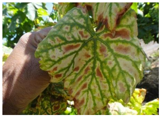
Fig. 16. Interveinal chlorosis

infestation, bore holes and leaves with interveinal chlorosis can be observed (Figure 16). More than one borer can