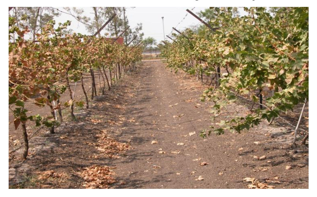
Fig 1. Severity of moisture stress symptom in vines on own roots (left) than on grafted vines (right)

During the initial years of establishing of vineyards on grape rootstocks in India, "Dogridge" was only rootstock the which was commercially accepted by most of the grape growers. Though this rootstock performed better during initial years of vineyard establishment, over the years few problems encountered with this rootstock such as more vigour on scions. reduced fruitfulness. accumulation of more sodium resulting in uneven bud sprouting and death of cordons etc. To overcome these problems associated with Dogridge under given soil and climatic condition, growers started establishing their vineyards on 110R rootstock based on the research findings of NRC Grapes. Pune. Rootstock 110R was known to induce less vigour on Thompson Seedless