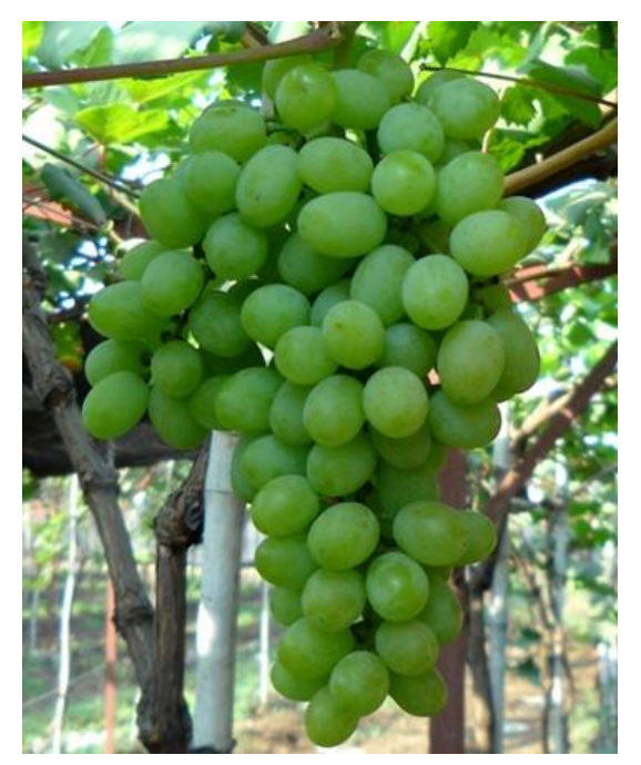
Fig. 9. Autumn Seedless

This variety was developed from a cross of Calmeria x (Muscat of Alexandria x Thompson Seedless) at USDA, Fresno, California.