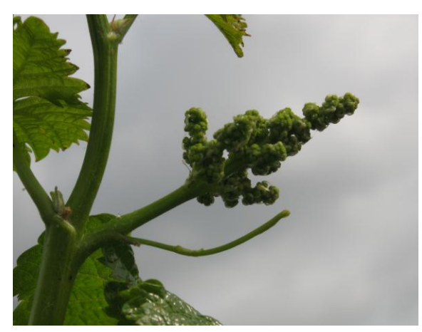
Fig. 11. Pre bloom stage of a bunch

uniform bunch development after fruit pruning.