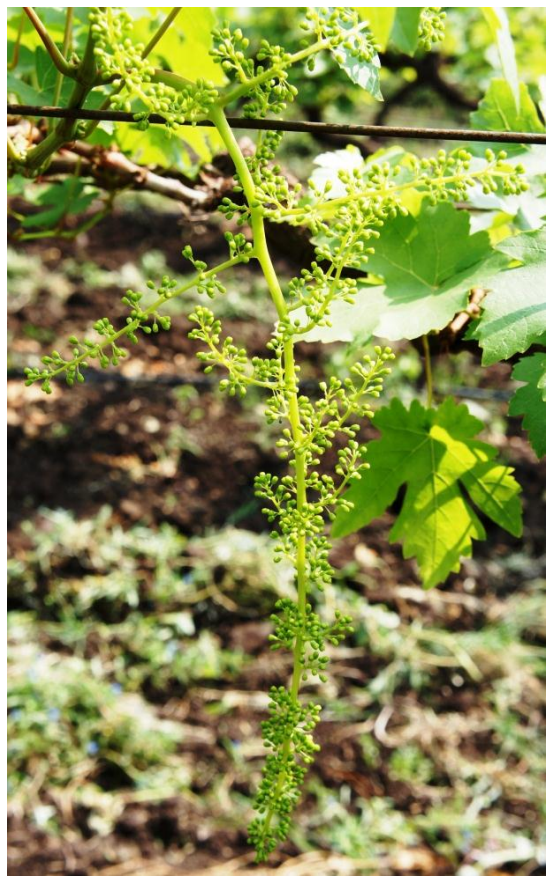
Fig. 2. Rachis / cluster elongation

Clusters are treated with Gibberellic acid (GA_3) for cluster elongation, thinning and to increase berry size.