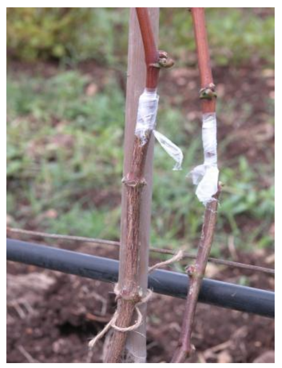
Fig. 1. Grafting of scion

Grapevine is trained to achieve high quality production. There are number of training systems used worldwide, however, no single training system is appropriate for all situations. Based on the vine vigour, degree of vineyard mechanisation and