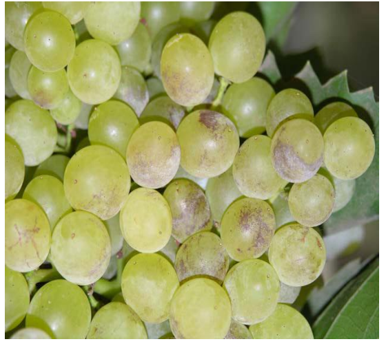
Fig. 4. Powdery mildew symptoms on berries - pigmented web-like appearance on surface