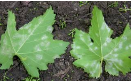
Fig. 2. Growth of downy mildew on lower surface of the leaf

In most grape growing areas of Maharashtra, Andhra Pradesh and Karnataka, normal time of fruit pruning is around 15<sup>th</sup> of October, but it can range from first week of July to last week of November. From disease management point of view, fruit pruning taken before 15<sup>th</sup> of October has greater risk of downy mildew, as there are more chances of rains and temperature is warmer. After fruit pruning, about 8-10 days are needed for sprouting of buds. Thereafter on