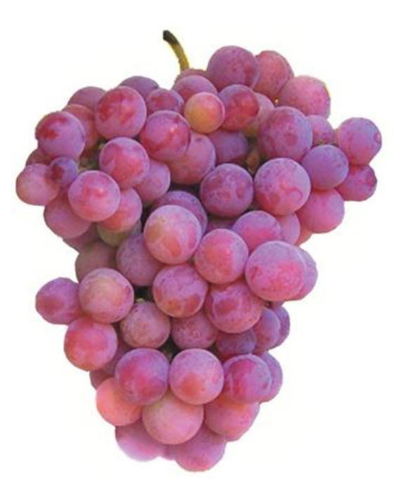
Fig. 3. Red Globe

Clusters are big, berries very bold (22-25 mm dia), red round, seeded with meaty pulp. It is a late ripening variety and takes more than 135 days from pruning. It has good keeping qualities and can be cold stored for at least 3 months. Fruit yield is about 20-25 tons per hectare.