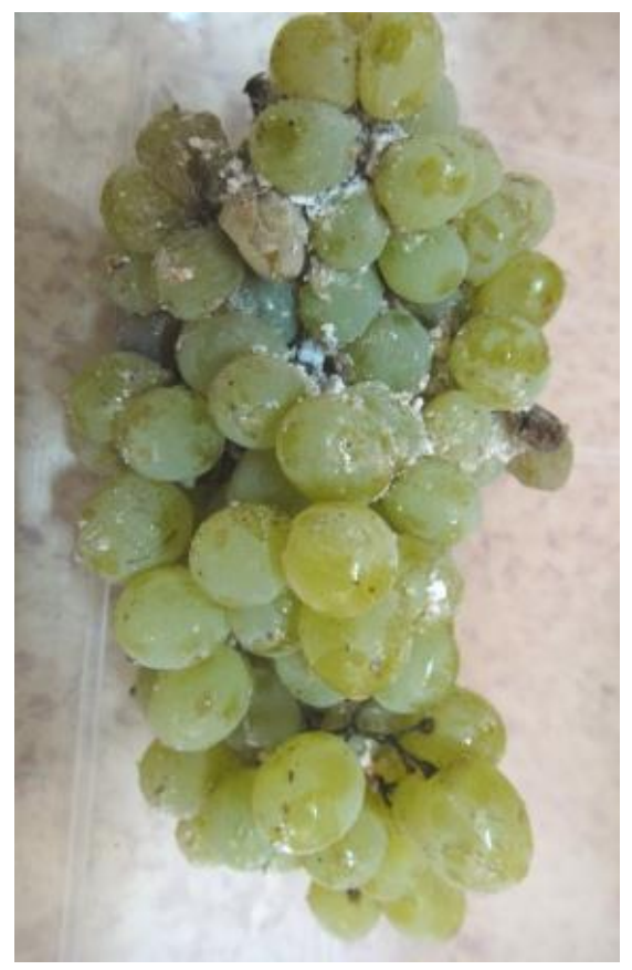
Fig. 10. Mealybug infested bunch

trunk, cordons and shoots to developing berries and produce profuse quantity of honeydew leading to sooty and sticky bunches (Figure 10) which considerably reduces the