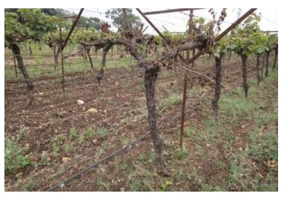
Fig. 18. Dead plant due to stem borer damage

of stem borer infestation in vineyards. Severe infestation leads to vine death (Figure 18).