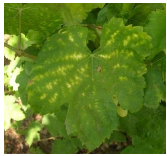
d. Mn deficiency