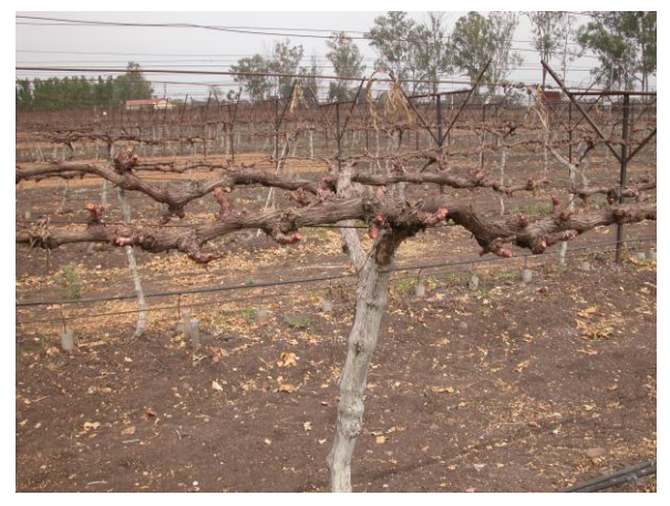
Fig. 6. Back pruning in grapes