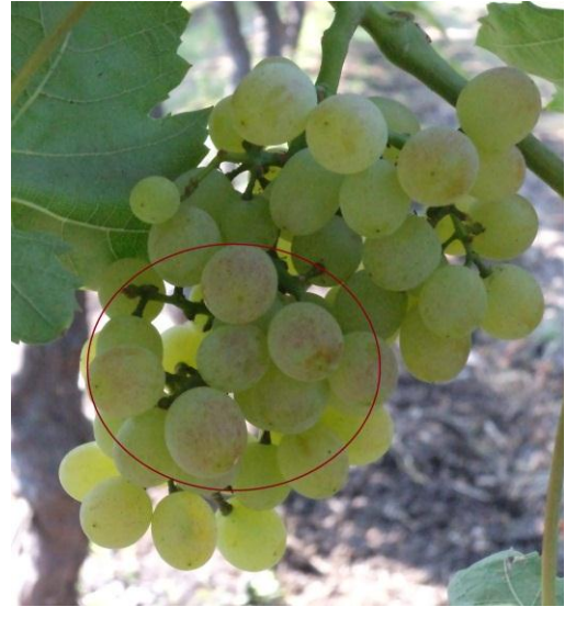
Fig. 3. Remove coloured berries

Trimming to remove immature, diseased, shrivelled, undersized, offcolour (Fig 3) or under developed and uneven sized (Fig 4) berries or side branches of the rachis should be done very carefully with sharp long nosed