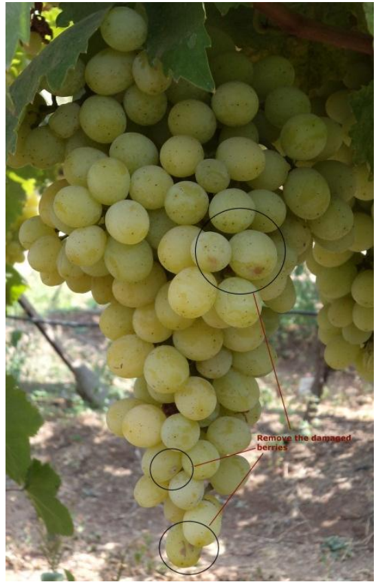
Fig. 2. Damaged berries

Bunches should be harvested during early morning hours before the berry temperature rises above 20°C, so that the berry temperature can be brought down to 4°C by pre-cooling within four - six hours. In case of dew, harvesting should be delayed till the dew has dried. If rainfall has occurred