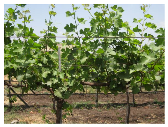
Fig. 9. Vertical shoot position after back pruning for effective fruit bud differentiation

5. While removing the excess shoots from the cordon, remove both vigorous and weaker shoots so that all the shoots will be uniform in diameter. This will promote