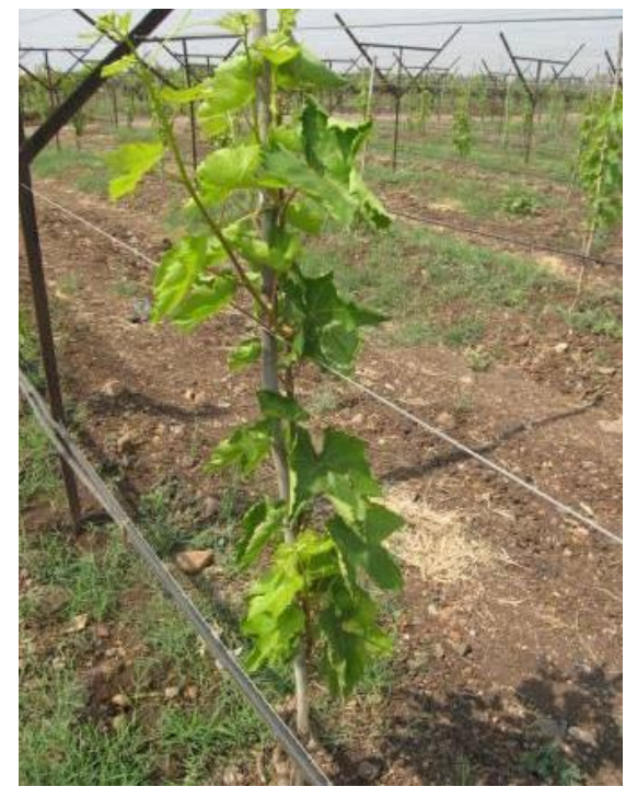
Fig. 4. Training of primary arm

Immediately after re-cut of grafted vines, the shoot grows vigorously. This shoot should be pinched six inch below the first wire so as to train the primary shoot in a slanting position. This will avoid the direct sunlight exposure of the primary arm.