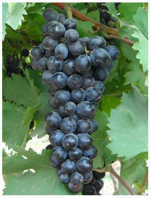
Fig. 4. Fantasy Seedless

Vines are vigorous require high sunlight exposure for adequate fruitfulness. This variety does not require GA<sub>3</sub> for thinning/ sizing. Some