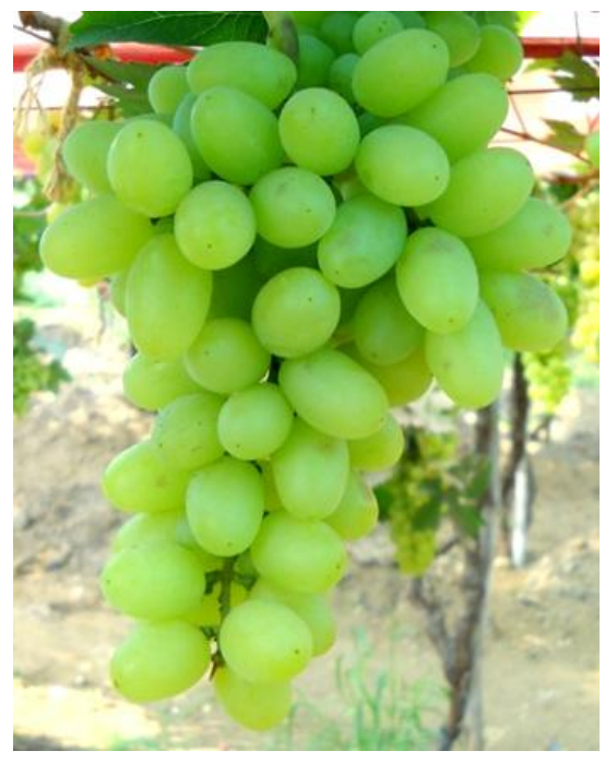
Fig. 2. Manjri Naveen

This variety ripens about 25 days early as compared to Thompson Seedless. It is a white seedless, naturally bold berry with mild muscat flavour table grape variety. It has uniform berries and clusters and do not require extensive thinning Extended operations. harvesting should be avoided, the ripe berries are less acidic and aromatic hence should be quickly packed for precooling and cold storage. Yield of 20-25 tons of exportable quality fruits can be obtained per hectare.