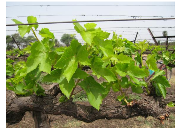
Fig. 8. Correct stage of sub cane

The requirement of canopy during each pruning under tropical region is as below.