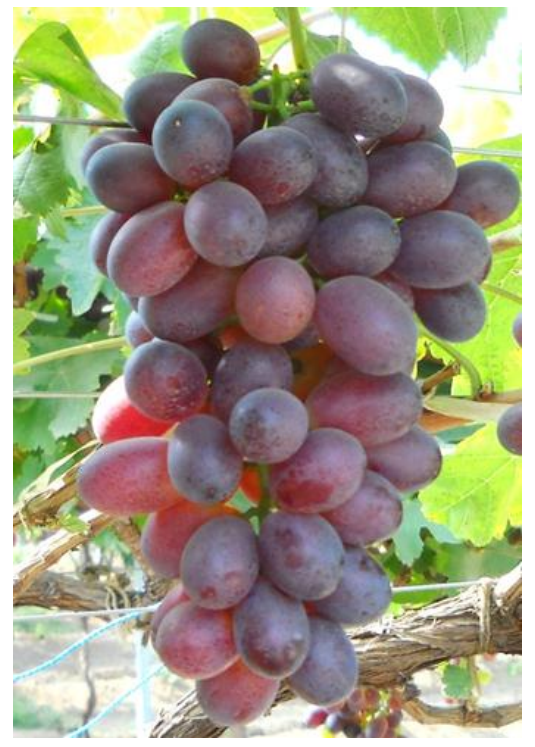
Fig. 7. Crimson Seedless

cross between Emperor x C33-199 at USDA, Fresno, California.