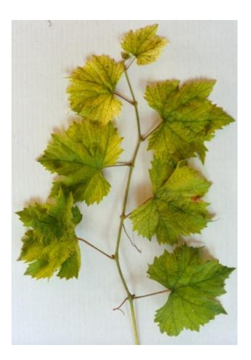
j. Interveinal chlorosis and reduced internode length and leaf size caused by Zinc

Fig. 1(g-k). Visual diagnosis of nutrient deficiencies/imbalances